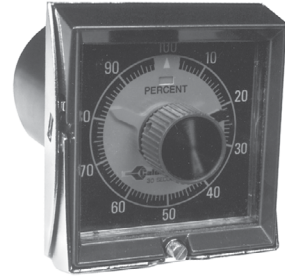
Figure 1 - Percentage Timer

Type OKT percentage timers (input controllers) are used mainly for pulsing power to metal tubular element radiant heaters. Where load voltage and current ratings exceed the timer contact rating, the timer can be used to switch contactors. Percentage timers cannot be effectively used on quartz lamp radiant heaters.