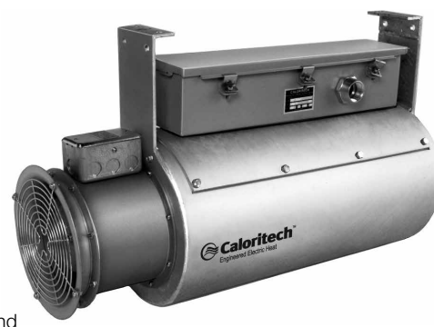
Figure 41 – WXS Series

Heating Element Dimensions - indicate insert length "B" and non-heated Section D. Allow 2% for manufacturing tolerance plus heater expansion when specifying "B" dimension.