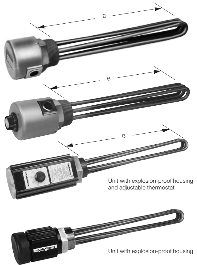
Table 3 – Screwplug Heaters (Two Elements) - 2" NPT