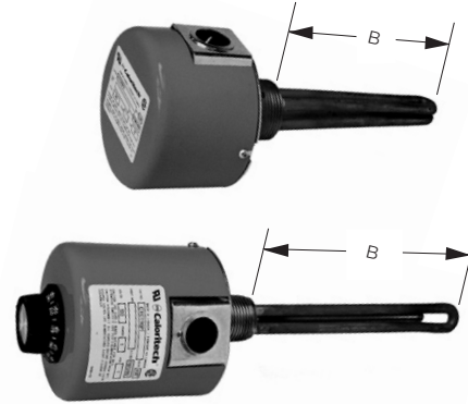
Table 1 – Screwplug Heaters (One Element) - 1" NPT